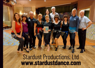
Stardust Productions, Ltd www.stardustdance.com