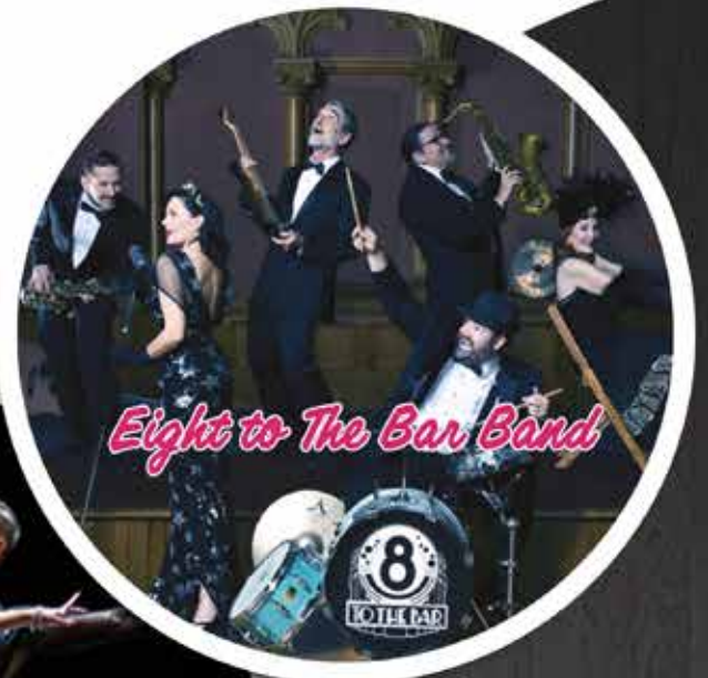
Eight to The Bar Band